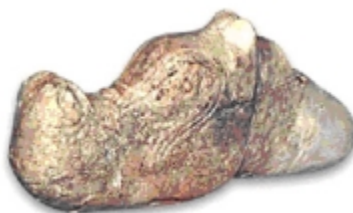
head of a sceptre, a symbolic object of elites at the end of the Chalcolithic era