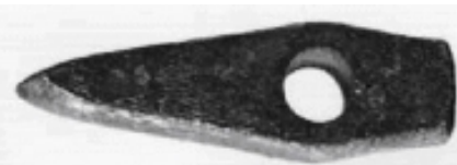
Shaft-hole axe of the Chalcolithic era, serving practical and status purposes