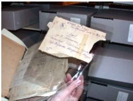
Documents from the Smolensk archives

The ceremony took place in the large facility that houses the entire collection of post-1917 archives for the region. Remarks by Russian offi-