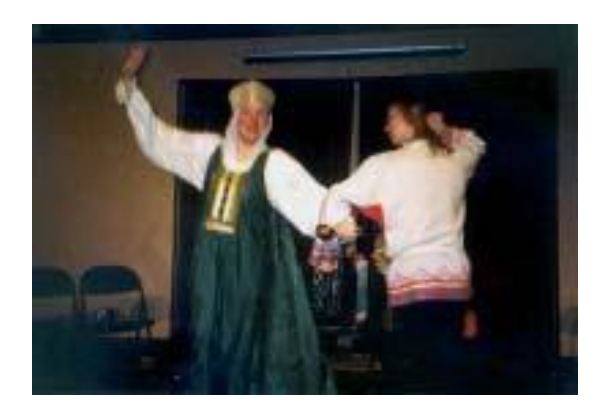
April 1 - A concert by Zolotoi Plyos, a Russian folk ensemble.