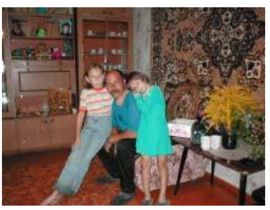
Kidsave International works to place orphaned children, like the ones above, with permanent families

Year's vacations with local families. Kidsave pays the families a small stipend so that they can provide the children the experience of living in a