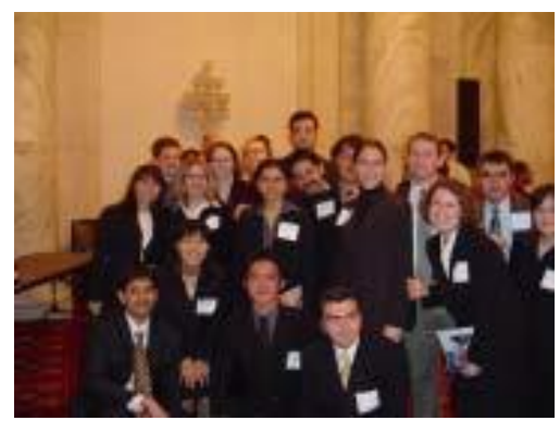
SPEA students pose for photo at reception with IU alumni

Washington D.C. is a city where graduates can apply their skills and talents. In addition to being our