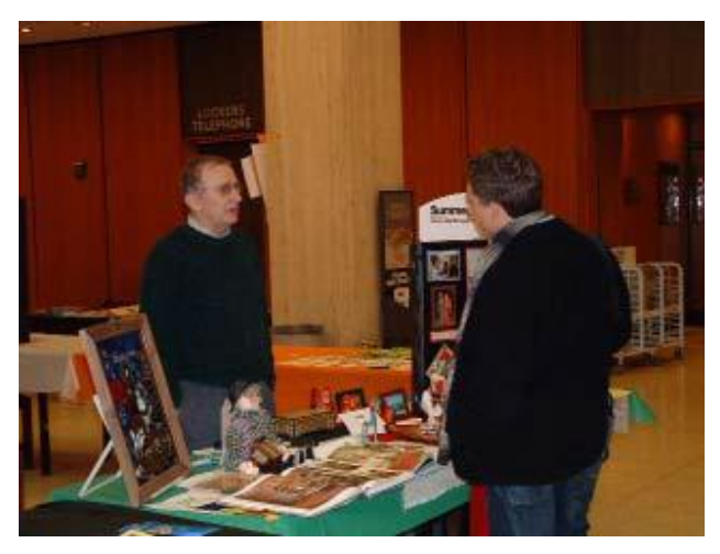
Febraury 3 - The Diversity Fair, held in Febraury, gave students the chance to talk to staff members who highlighted some of the Slavic resources IU can provide.