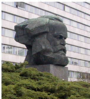
Marx watches transition in Chemnitz.

Between 1945 and 1989, East Germany shared with the Soviet bloc the brutal experience of communism. An ideological split and a fence along the border neatly separated East from West. After the collapse of communism and the re-establishment of a single Germany with a single government, NATO aircraft patrolled East German skies and citizens of the former GDR became citizens of the European Economic Community long before the citizens of Hungary or Poland. Yet, the ongoing transition in this region of Germany has much in common with the post-communist transitions in other states more frequently designated "East European."