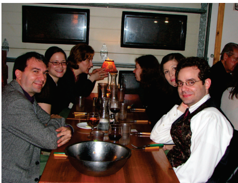
Past, present, and future REEI students enjoy a meal at La Petit Cafe in downtown Bloomington.