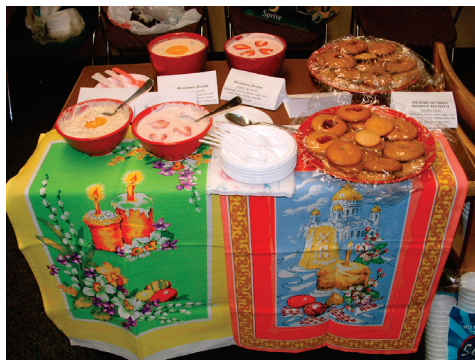
Traditional Ukrainian cookies, bread, and cheese were part of the pysanky festivities.