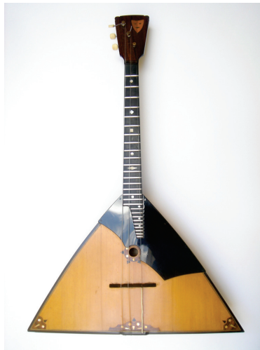
A 1991 balalaika from luthier Marc Koupfer

Today, what we know of as balalaika orchestras is not in fact composed entirely or even mostly of the various sizes of balalaikas. A section of domras and one or two gusli (instruments also "standardized" by Andreev); accordions and their Russian cousins, the baians ; and various wind and percussion instruments provide balance and contrast. There is much in their repertoires that would not fall strictly under the "folk" category, though other genres, such as film songs and popular songs from the World War II era, often draw upon a perceptibly folk-like idiom. These