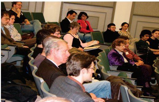
Students, faculty, staff, and conference participants listen to the keynote address given by Vladimir Tismaneanu.