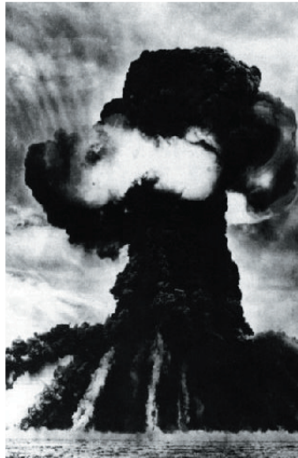
Soviet Chagan Nuclear Test

This cooperation resulted in the development of extensive expertise in concluding responsibility and immunity agreements for contractors, and in the safe and secure dismantlement, shipment, storage, and disposal of weapons components and material. This expertise, acquired