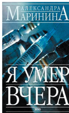
All is Not Well and I Died Yesterday

Responses to the rise of a modern women's movement in post-Soviet Russia were ambivalent and often hostile. Backlash from men and women alike was not unusual. Post-Soviet Russian literature, including popular or pulp fiction, reflected the conflicted response to feminist ideas. Russian feminism and popular literature intersected in the up-and-coming female detective genre of the 1990s. This intersection and conflict is demonstrated in the way Aleksandra Marinina characterizes