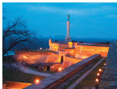
The Pobednik (Victor) monument in Belgrade, Serbia