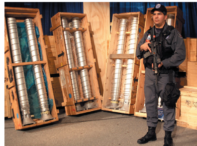
Intercepted nuclear material Pakistan sold to Libya

Unfortunately, "peaceful" civilian nuclear reactors designed to produce electricity require the same parts and material (Low Enriched Uranium or LEU) as reactors built for military purposes. Thus, weapons-grade material