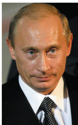
President-elect Dmitrii Medvedev and current President Vladimir Putin