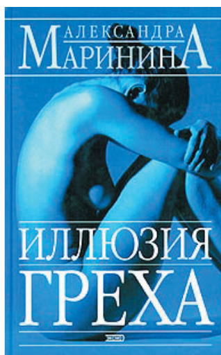
The Illusion of Sin all book covers

Prior to the 1990s in the Soviet Union, the concept of a female detective genre was reminiscent of Agatha Christie's Miss Marple. No Russian equivalent to the Western woman detective, such as P.D. James's Cordelia Gray in An Unsuitable Job for a Woman (1972), Marcia Muller's Sharon McCone of Edwin of the Iron Shoes (1977), or any of the three most prominent female sleuths in the last thirty years (Sara Paretsky's V.I. Warshawski, Sue Grafton's Kinsey Millhone, and Liza Cody's Anna Lee) existed in the Soviet Union. Female detective novels, however, proved a marketable, popular, and inexpensive reading option in post-Soviet Russia. From 1994 to 1998, according to Knizhnoe obozrenie , works of detective fiction by female authors almost equaled that of male-authored crime fiction in popularity, and by 1998 they exceeded their male counterparts in bestsellers. Leading the pack in this unprecedented breakthrough by female authors was Marina Anatol'evna Alekseeva, who writes