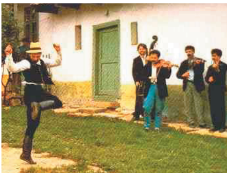
Téka troupe circa 1988

The dance-house movement started during the 1970s as a folk dance revival based on Hungarian folk music and dance, especially from Transylvania. By the early 1980s, the movement blossomed into a major cultural force influencing Hungarian identity. Beyond its cultural impact, the dance-house movement took on political relevance as dancers in Hungary learned about the repression of Transylvanian Hungarians by Romanian Communist dictator Nicolae Ceaușescu. The conference was a great success and participants are already looking forward to next year's Ránki Symposium.