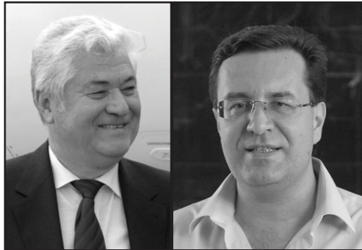
Vladimir Voronin (left) and Marian Lupu.