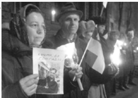
"Kuchma, where is Gongadze?" Protestors in Kyiv.