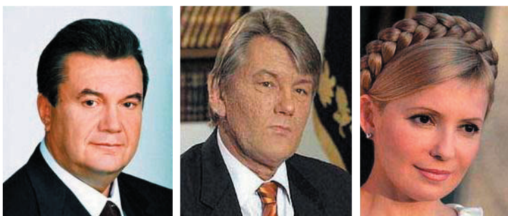
Viktor Yanukovich, Viktor Yushchenko, and Yulia Tymoshenko