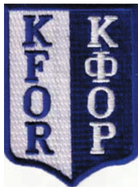
Pocket badge of KFOR