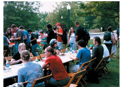
SWSEEL students enjoying the fruits of a Russian cooking demonstration

professors who the previous summer listened to me stumble over saying what color my t-shirt was. A few of the first year students even asked if I were Russian!