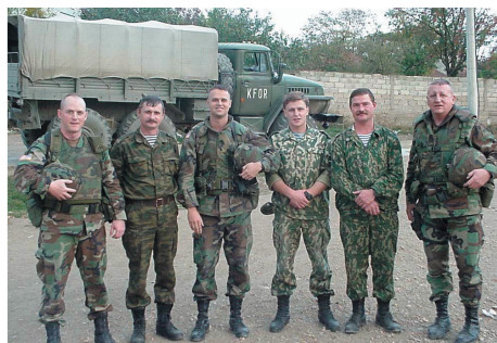
Joint patrol of Russian and American officers. Author is on far right