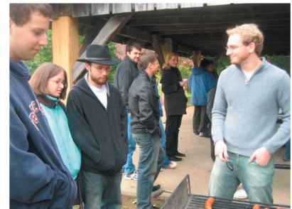
Students at the grill