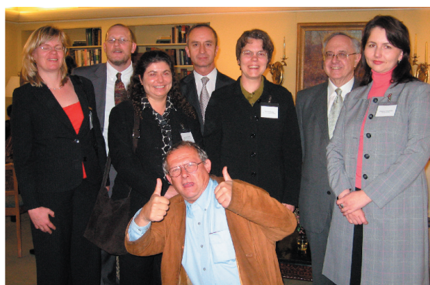
Conference organizers and guest speakers:

call for papers on memory as objects (material culture), memory as representation (artistic culture), memory and time, memory and space (city and border regions), memory and politics (symbolic capital), memory and healing, and Polish-German memory discourse in academia. The finalized program—published half a year later superimposed over maps depicting Central Europe in all its geo-political complexity—displayed evidence of