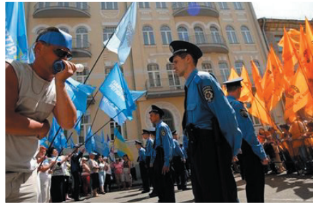
Blue and Orange Protestors separated by the police