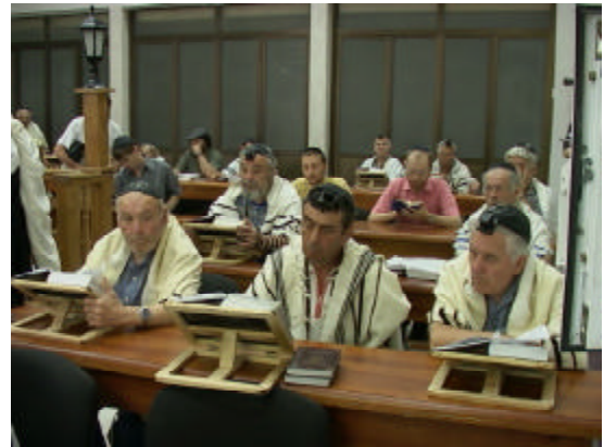
Morning Prayer in the Zhitomir synagogue