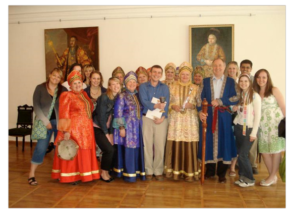
US-Russia Global-Health Care Course Study Program participants with the Starocherkask Cossack Choir.

Health and East Europe continued from page 4