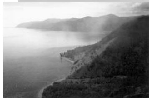
The shores of Baikal

On the night of my student talk we sat together in the High Sierras, discussing the international phenomenon of invasive species. We