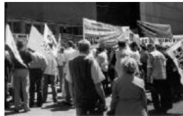
Street protest in Warsaw

It is not far fetched to question whether democracy and the free market will survive. The government under Prime Minister Leszek Miller continues to move forward with the goal