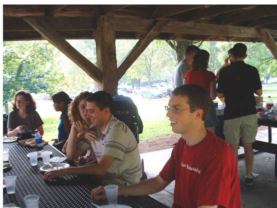
New and returning students, staff, and visiting scholars enjoy the annual REEI Fall Picnic