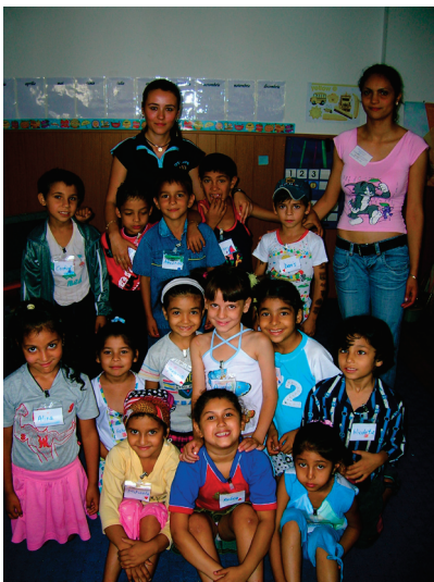
Roma children at Ovidiu Rom's summer school

I enjoyed my time at the Embassy and learned a lot while I was there, yet the best part about this summer was simply being back in Romania. Speaking the language again, remembering fun idioms I had long since forgotten, being with friends I had not seen in three years, and making new ones—these were the highlights and memories I will not forget.