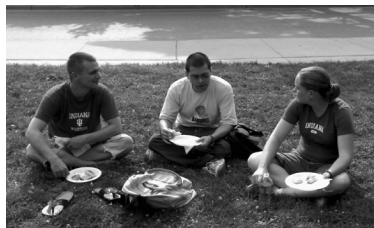
SWSEEL students enjoy a Russian cooking demonstration