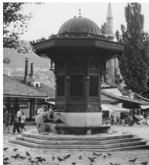
Sebilj fountain

In Sarajevo, they say that anyone who drinks water from the old fountain in Sebilj Square will return. I knew immediately upon arriving for the first time a few years ago that I wanted to come back, and this past summer I received an exciting opportunity: to intern in the political section of the US Embassy to Bosnia and Herzegovina. As a student of Bosnian history and politics, this mission was particularly welcome because of the international community's close involvement with the Bosnian government, especially on constitutional and judicial reforms.