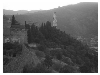
A view of "Mother Georgia" from Narikala Fortress in Tbilisi

bloodshed of the 1990s when the authoritarian, Aslan Abashidze, took control, enabling the region to enjoy comprehensive political and economic freedoms from Georgia proper