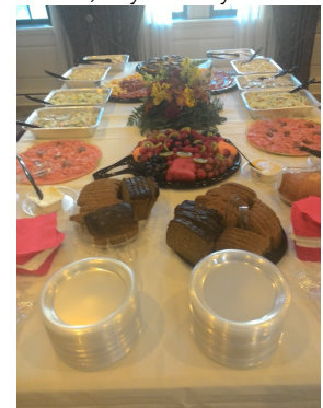
The culinary delights of the reception