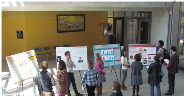
REEI students at the Poster Exhibition