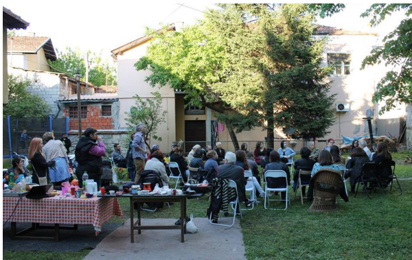
A community gathering at the Banja Lunka Social Center (BASOC)