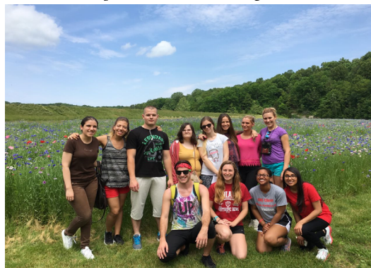
Group participants enjoy a beautiful field in Vojvodina, Serbia.