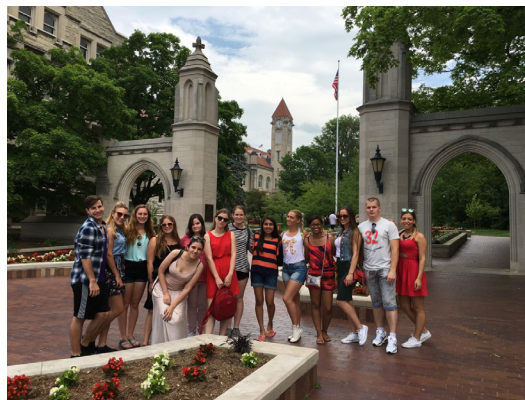
Serbian and IU group participants at the Sample Gates in Bloomington, IN

The program is scheduled to be repeated in the summer of 2017 with an expanded number of programs in Serbia with whom the IU students will work. In addition, interest both among IU students and University of Belgrade students indicates that numbers in both groups are likely to increase.