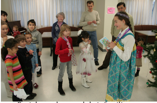
Rosinka students and their families at a traditional Russian winter holiday celebration.

Founded in September 2009, the Rosinka Program in Russian Language and Culture currently serves children who speak Russian as a heritage language and meets on Fri-