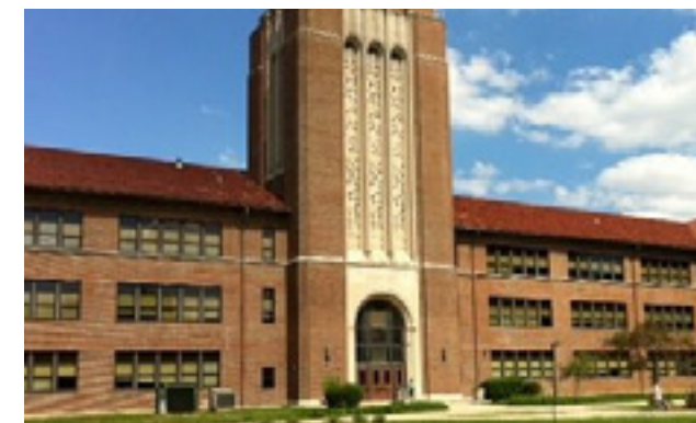
Arsenal Technical High School, home to the only high school Russian program in Indianapolis

High school students and teachers of Russian in Indiana, REEI salutes you! Молодцы!