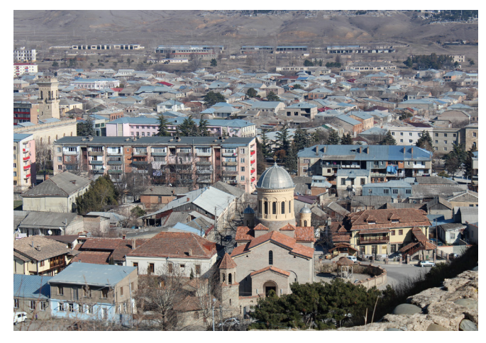
A view of Gori, Georgia

and people who were out of work couldn't buy industrially canned food or couldn't buy very much of it. I got to make three trips there where we just ran all over the country like crazy people. The interesting thing was that Georgia was horrible then. It was a failed state. It was like the Somalia of the former Soviet Union in a lot of ways, and yet I just fell in love with it. A friend of mine once called Georgia "a terrible and beloved country," and that's what it remains to me-both a terrible and beloved country. Certainly in terms of infrastructure and economics, Georgia has changed radically since the Rose Revolution, but it still remains highly subject to dramatic political shifts. Just in the years that I've been working there, which is now since 2002 so 13 years, there has been a revolution, an invasion, and the first democratic transition of power to a not-so-stable coalition government. It's hard to be bored in Georgia.